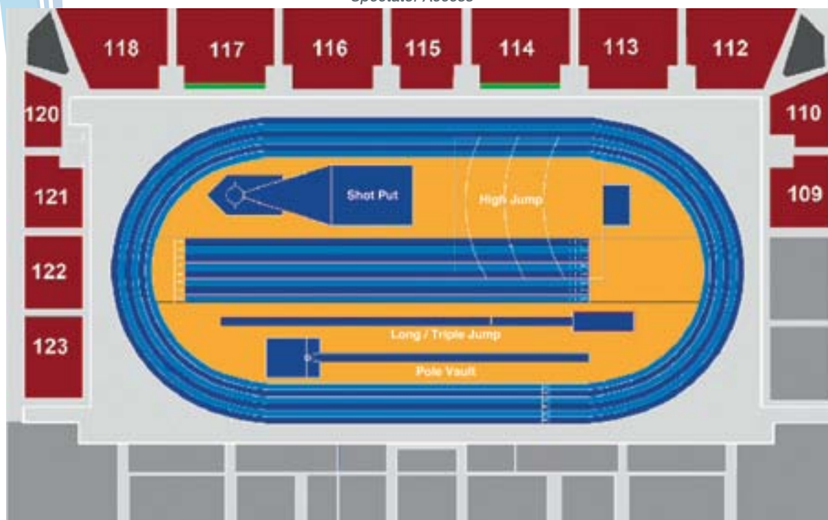
Atakoy Athletic Arena